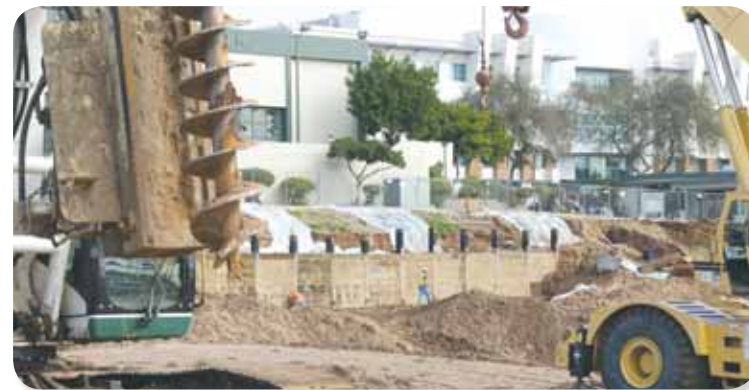
Construction crews work on the foundation of the College's new $24.5 million Parking Structure #3. The new structure will provide students and faculty with more than 1,800 parking spaces, reducing time and gas consumption as students circle or travel from lot to lot looking for a space to park.

The $20.7 million Utility Infrastructure and Traffic Improvements project – designed to upgrade the campus' utilities systems for future growth – got underway and is expected to wrap up in fall 2008.