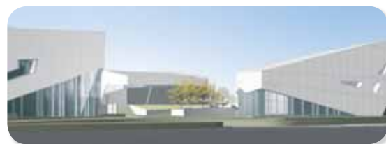
Performing and Fine Arts Project. The project has already gone to bid and came back under estimate.