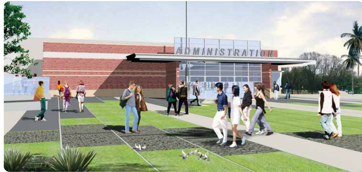
The E1 Project – which includes the complete renovation of the 45,000 sq. ft. building as well as the development of a two-story, 13,000 sq. ft. addition – will convert the existing Administration Building into a one-stop service center.

The Baum Center G1 Building will be renovated into a 40,000 sq. ft. administration building. The budget of the two projects is $27.5 million and construction is set to begin spring 2008.